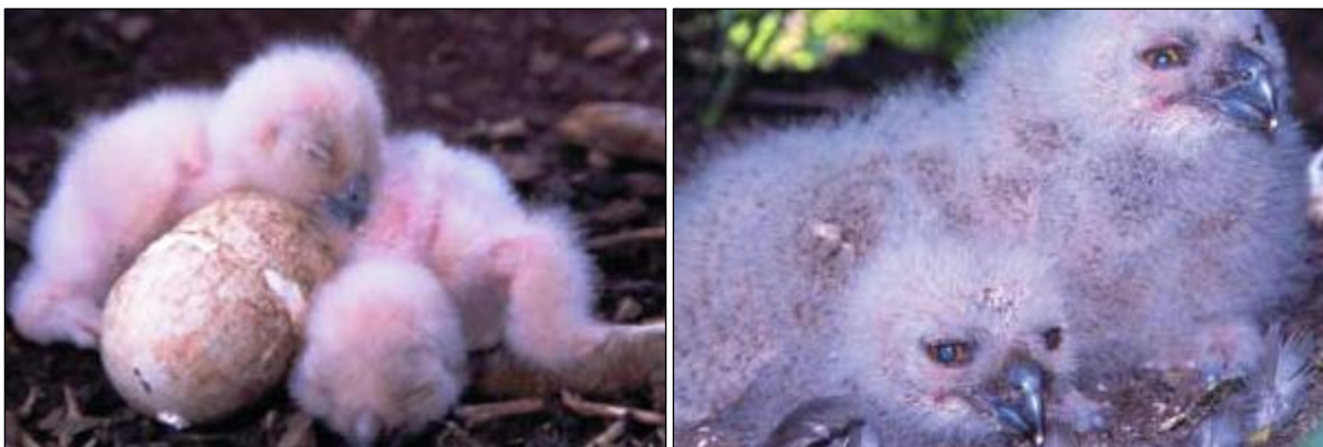
Eurasian Eagle Owl chicks at 2 (left) and 15 (right) days of age (Penteriani et al., 2004).

Adult owls tend to be very sensitive, abandoning eggs and even young at the slightest disturbance. White and fluffy at hatch, owlets develop quickly, feeding themselves at the nest after only three weeks. Remarkable increases in mass are noted in the first 30 days, and between days 40-45. After the age of 80-90 days, chicks (still fed by their parents) move widely, ranging up to 1500 m from the nest in one study. By seven weeks, young are able to fly; the owlets are independent at 150-160 days' of age (Penteriani et al., 2004). Cainism is common in this species, with older young preying upon younger owlets.