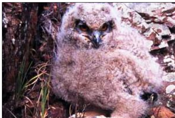
Eurasian Eagle Owl chick at 30 days of age (Penteriani et al., 2004).